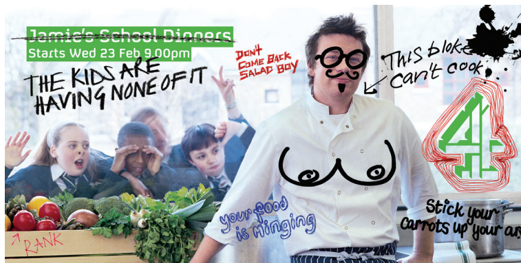
Figure 2. Posters