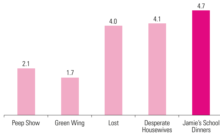
Figure 5. Average first episode viewers per £1k spent on paid-for media