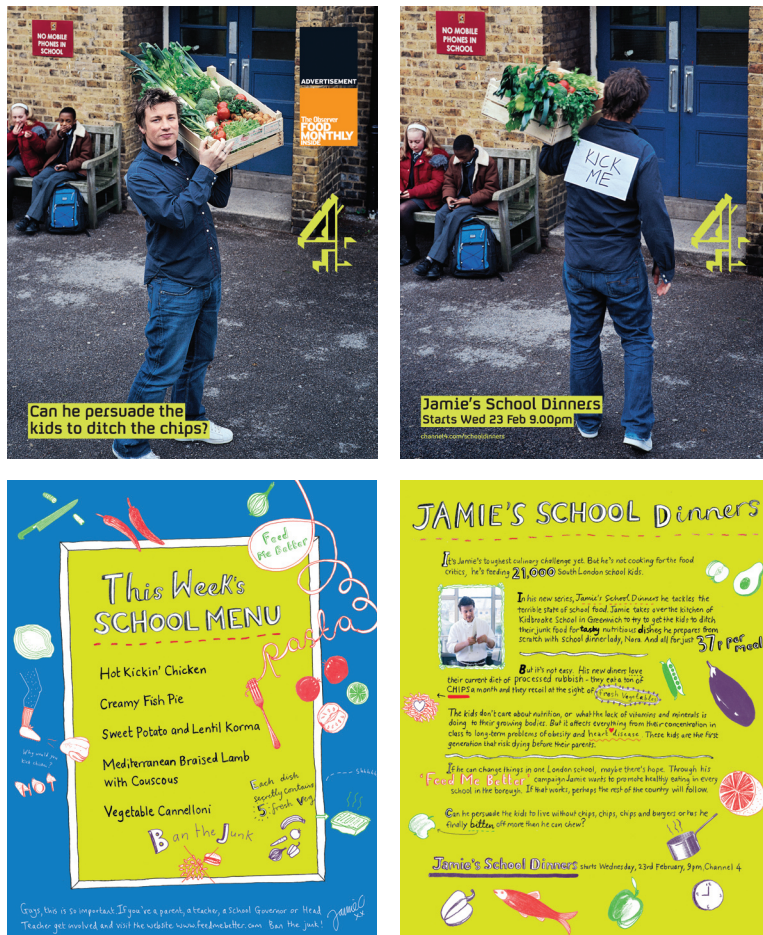
Figure 3. Observer Food Monthly cover wrap

Once the series had begun in a blaze of publicity, the press began to run with the story. PR throughout this stage was critical in providing information and resources to journalists, escalating this from a TV series to a serious national issue.