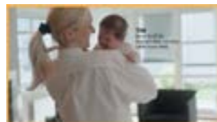
IKEA IKEA Baby Boom Norway