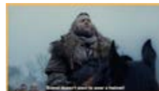
Helmet has always been a good idea Danish Road Safety Council Denmark