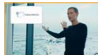
Welcome to the Icelandverse Visit Iceland Iceland