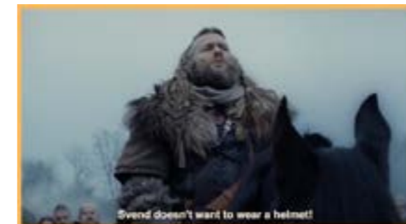
Helmet has always been a good idea | Danish Road Safety Council | Denmark