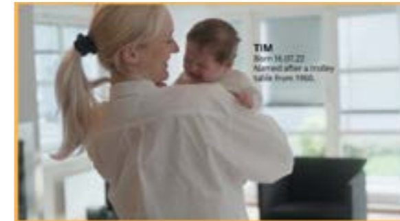
IKEA | IKEA Baby Boom | Norway