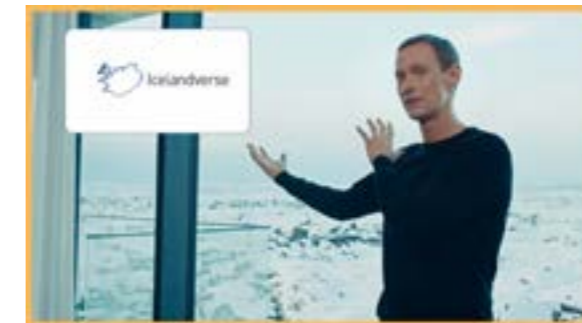
Welcome to the Icelandverse | Visit Iceland | Iceland