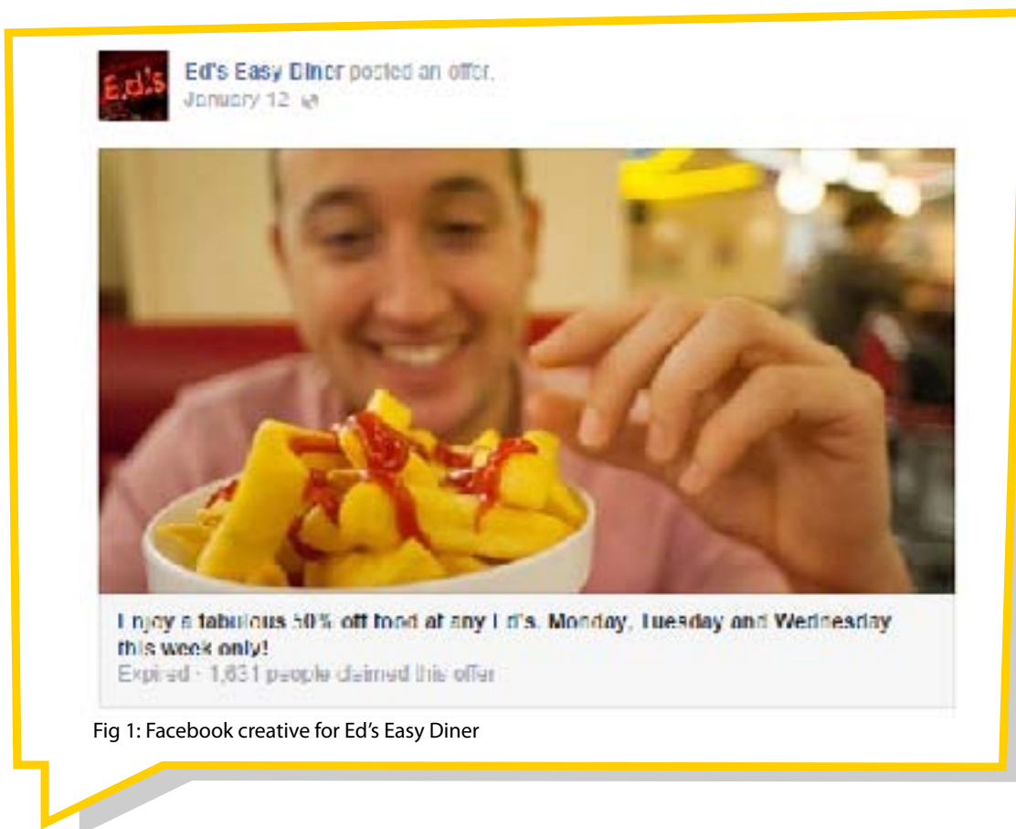
Fig 1: Facebook creative for Ed's Easy Diner

The promotion offered 50% off food at the diner during this time. Communications focused on fans, anticipating that they would share this offer.